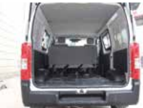
Aluminum alloy floor surfacing