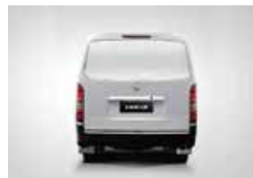
Flat roof, meeting different space requirements