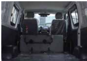
Passenger area front tilting 3-person bench