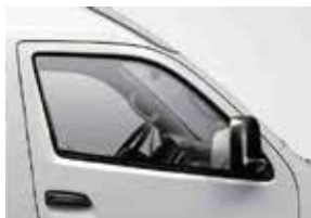
Black housing rearview mirror and door knob