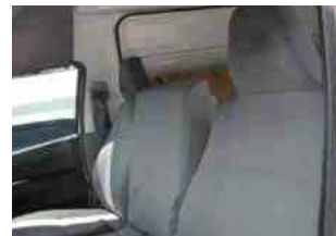
Front row 3-person bench