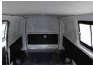
Simplified interior trims