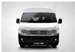
White body (black bumper)