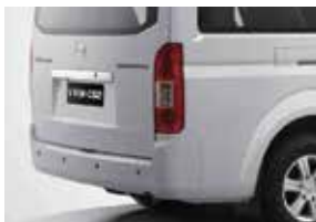
Black bumper and freight rear step